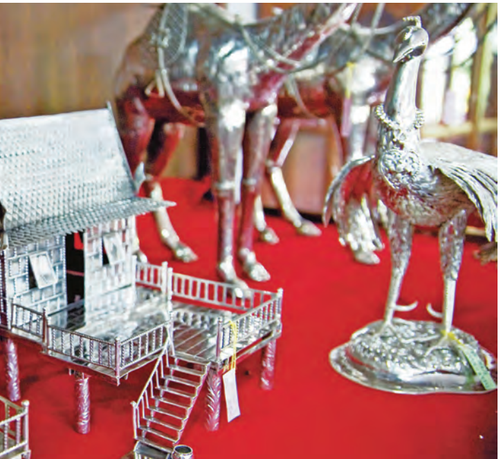
Khrueng Ngoen (Silverware)

There are a variety of famous local products and souvenirs such as fabric in the Nam Lai design (cotton), rattan basketry, and silverware made by the hilltribe people.