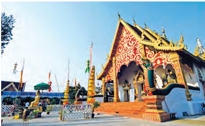
Wat Suan Tan

In the past, the location of the temple was the centre of Nan when the town was moved from Phra Borommathat Chae Haeng to the western bank of the Nan River. The chedi was constructed of laterite during the period of Phranang Chammathewi. Its characteristics are similar to the Ku Kut Chedi of Lamphun. The square chedi comprises 5 tiers with niches. In the niches on each tier are standing Buddha images which were influenced by the Sukhothai style of art, similar to those discovered at the chedi of Wat Mahathat in Sukhothai province. The top of the niche was made of bricks into an arch, the construction pattern during the reign of Phrachao Tilokkarat of Chiang Mai town, presenting that the renovation was taken place during that period when the influence of Chiang Mai art had already replaced the Sukhothai one.