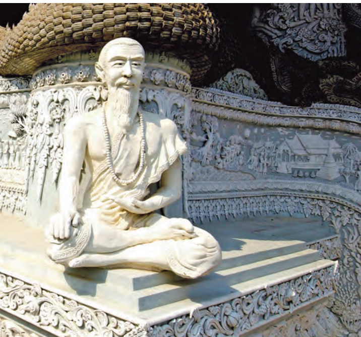
Wat Ming Mueang