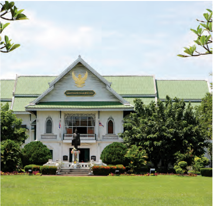
Nan National Museum

Nan National Museum is on Phakong Road, opposite Wat Phrathat Chang Kham, near Wat Phumin. It is a European style building which came to Thailand during the reign of King Rama V combining with