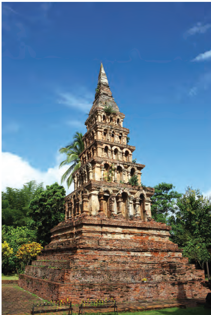
Wat Phaya Wat

Within the ordination hall is enshrined “Phrachao Fon Saen Ha” or “Phrachao Sai Fon”, which the Nan people once took in the procession asking for rain. Moreover, there is a sermon pulpit engraved by the local Nan craftsmen. It is considered as the oldest one made by the locals and assumed to have been constructed during the reign of Chao Attha Warapanyo around the late 18 th - early 19 th century.