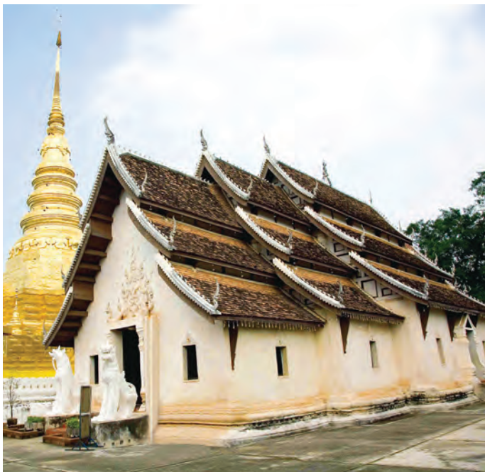
Wat Phrathat Chae Haeng

Wat Phrathat Chae Haeng is a sacred place of worship, situated on a mound on the eastern side of the Nan River, at the former centre of the Nan town after moving from Pua town. Wat Phra Borommathat Chae Haeng was constructed during the rule of Chao Phraya Kanmueang (the Feudal Lord of Nan during 1326 - 1359) as an enshrining venue of 7 Buddha relics, silver and golden votive tablets presented by King Maha Thammaracha Lithai on the occasion that Chao Phraya