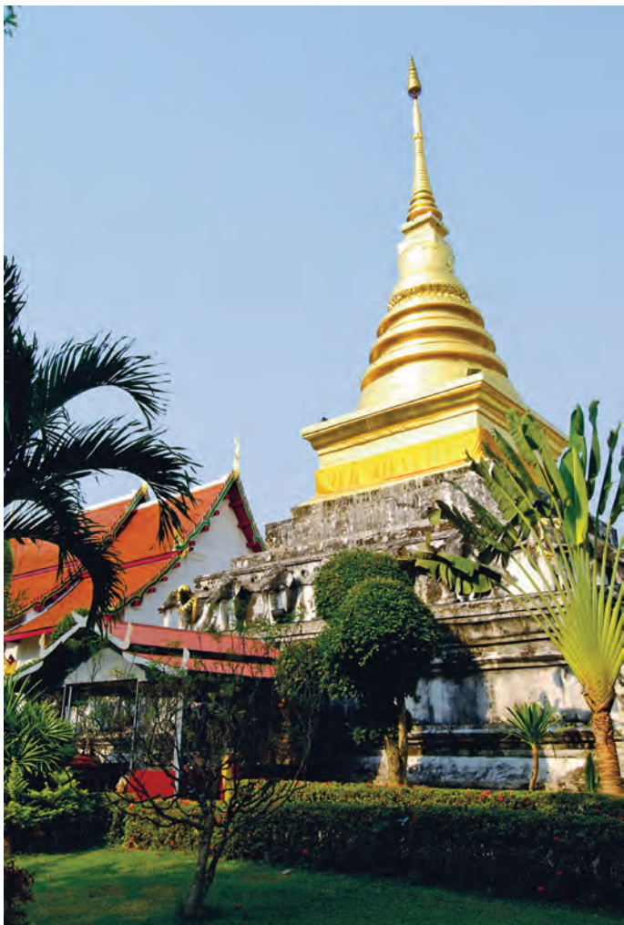
Wat Phrathat Chang Kham Worawihan