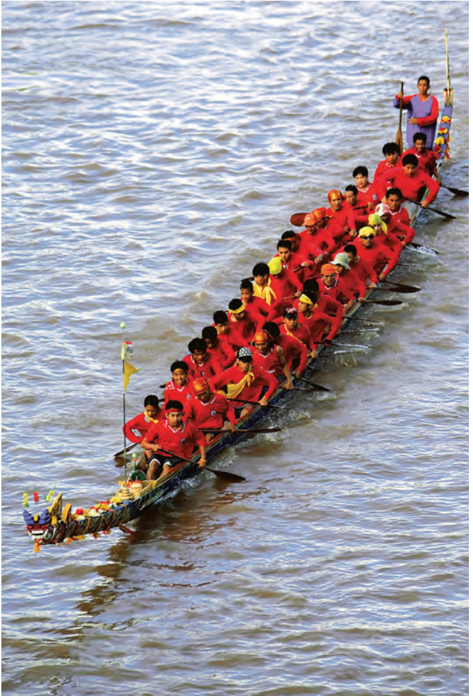
Nan Traditional Boat Races

Each boat in the races is made of a huge log. The distinguishing characteristic of the Nan racing boat is its engraved prow into a graceful Naga design, while its tail is similar to that of a Naga raising up. This is because the Nan people believe that their ancestors, Chao Khunnun and Chao Khunfong were born from the Naga's eggs which are symbols of fertility. The boat construction in a Naga design is considered as a worshipping practice to the graciousness of the Naga, the master of the river and ancestor of the Nan people.