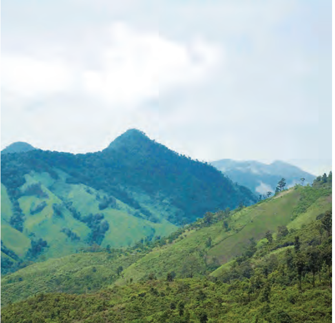
Doi Phu Kha National Park