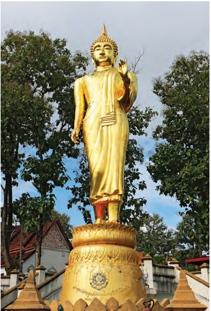
Wat Phrathat Khao Noi

Nan is a Lanna town where Buddhism has been propagated for a long period of time. Therefore, within the compound of the ancient towns both in Mueang Nan district and Pua district stands a Phrathat located elegantly on a rise. Fairs to pay respect to major Phrathats are organised annually as follows: