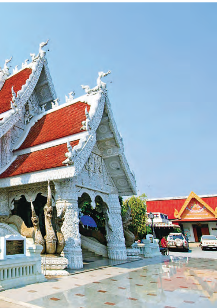
Wat Ming Mueang

The museum is divided into 2 floors. The lower one presents the lifestyles of various tribes in Nan, including major traditions and festivals such as the life extending ceremony, boat races, while the upper one displays the artefacts of various periods discovered in Nan since the pre - historic time until the period of the Nan rulers. The important piece is the black elephant tusk, the sacred and valuable object of Nan. It is the left-side one with a length of 94 centimetres, a circumference of 47 centimetres, and a weight of 18 kilogrammes. The tusk was given to Nan during the period of the 5 th Nan ruler, Phraya Kanmueang. Other exhibits include the glazed ceramics, aged